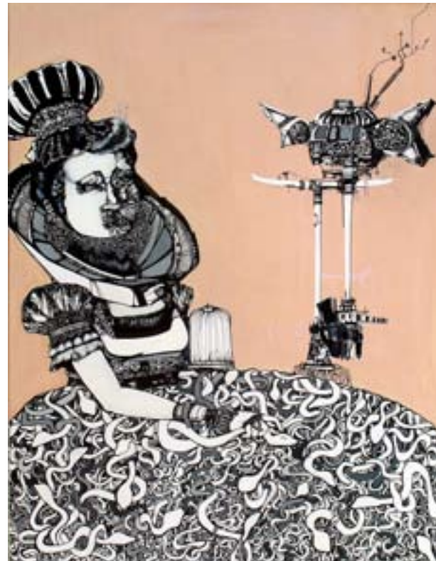
pen, gouche, and collage on paper/21" x 16"/2005/aprilloveday.org

Breast implants and pre-Viagra penile pumps express the desire to increase our bodies' vocabulary. (Animal behavior scientists call this somatized language "mating display behavior.") Those whose cell phones permanently accessorize their persona merely express a less radical urge to increase the body's vocabulary power. The concept of "cell phone" clearly